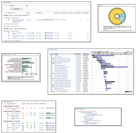
BrightWork Project and Cross-Project Reports

"BrightWork delivers customizable SharePoint templates for managing different project types and also for managing across many projects. This gave us a very fast yet flexible starting point" Northamptonshire County Council, UK | 100 Users